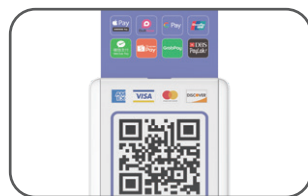
4R large code.